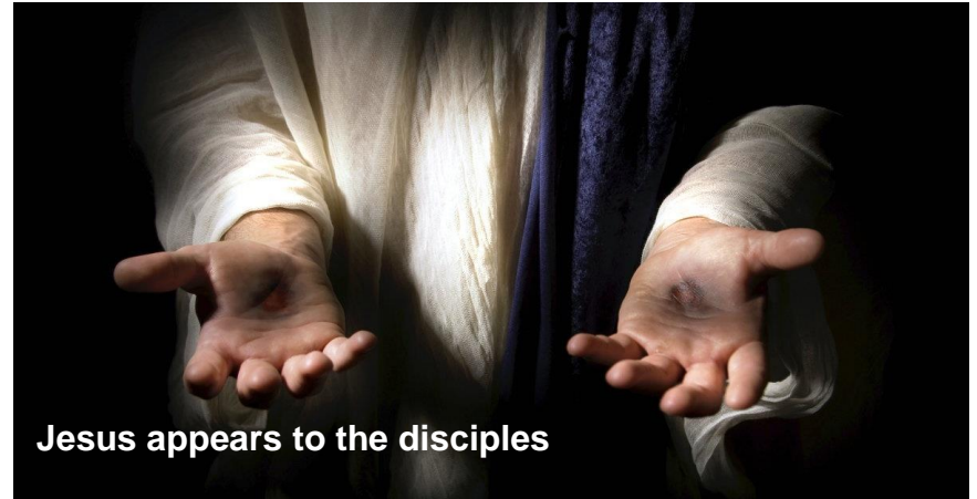
Jesus appears to the disciples